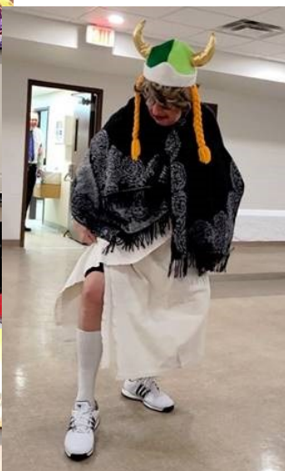
Broom Hilda at her best!