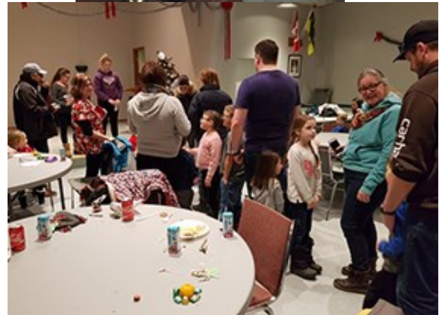
Top Photo: Planning of the revival of the Little Chicago Nights. Photo above: Children's party put on by the Equestrian unit