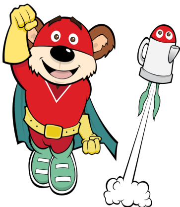
Boots and Brewster