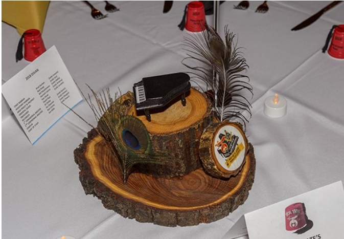
Photo above: Table centerpieces for the 2018 Family Reunion Potentate's Ball.