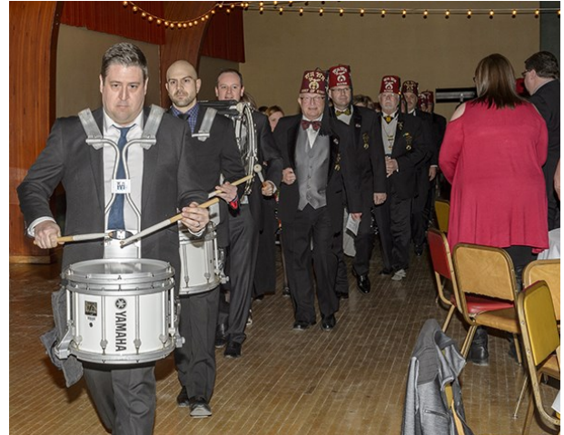
Photo above: The Rider Drumline leading in the 2018 Divan members.