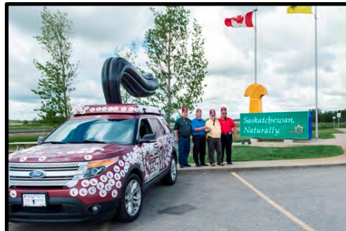
Exchanging keys at the border.