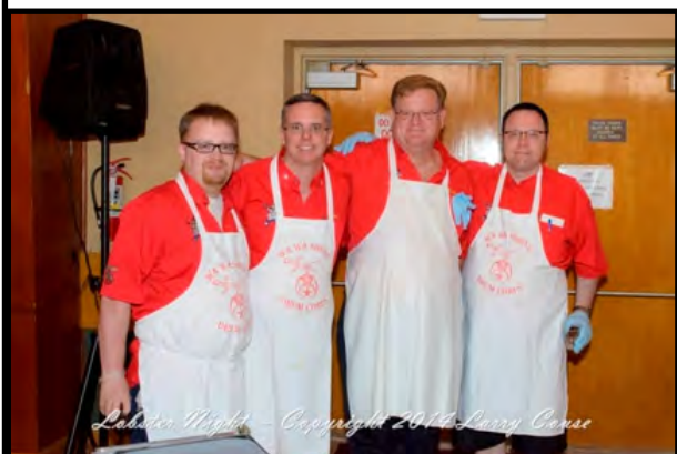
Annual Lobster Night

If any Regina Noble is interested in joining the Drum Corps or would like to see what its all about, please join us Monday evenings at 7:30 at the Regina Shrine Centre.