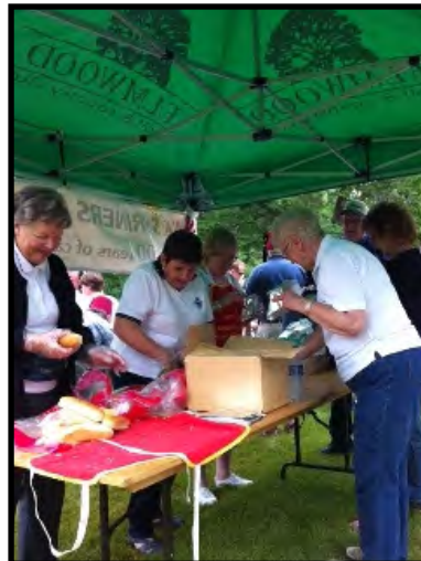
Shrine and ACT ladies preparing the grub

The Club, in co-operation with the ACT club, treated all participants and their parents to hot dogs, drinks and ice cream after the Frontier Days Kiddies parade. The event was highly received and brings super publicity to our great philanthropy.