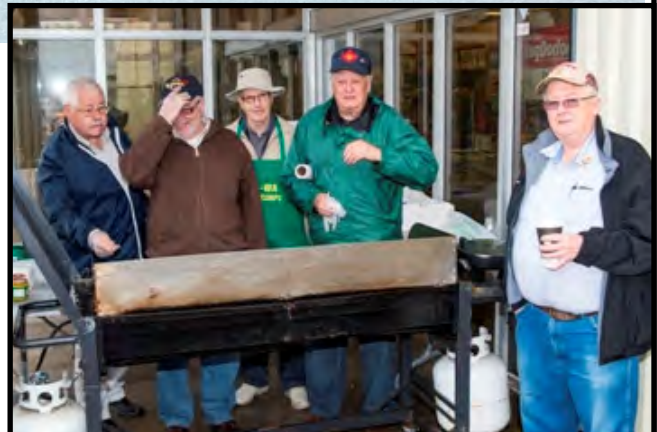
Co-op Hot Dog Sale