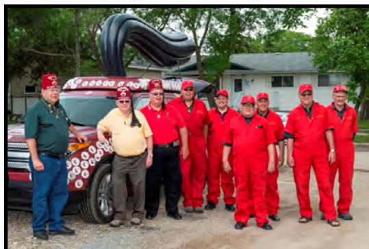
Scooter procession into Moosomin.