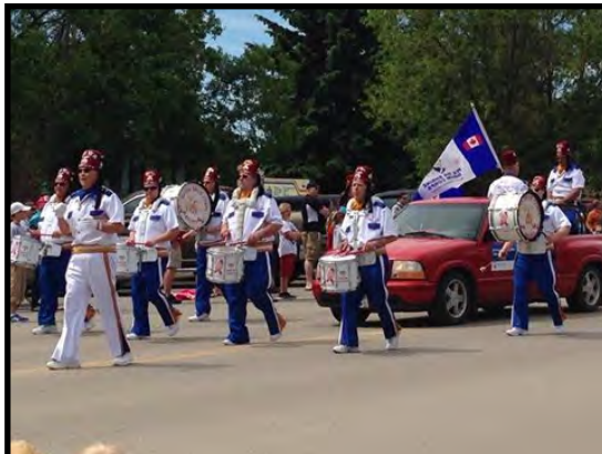
Fort Qu'Appelle Parade