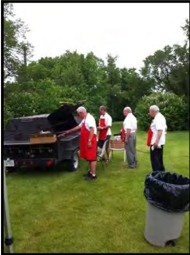
Cooks getting ready for the Kiddies Day Parade.