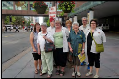
Enjoying Imperial in Minneapolis

Everyone enjoyed tea, sandwiches and dainties served on beautiful yellow rose patterned plates set on pretty lace covered tables. A table of home baking was also available for sale. Regina's ladies were made most welcome and enjoyed a day out supporting Swift Current.