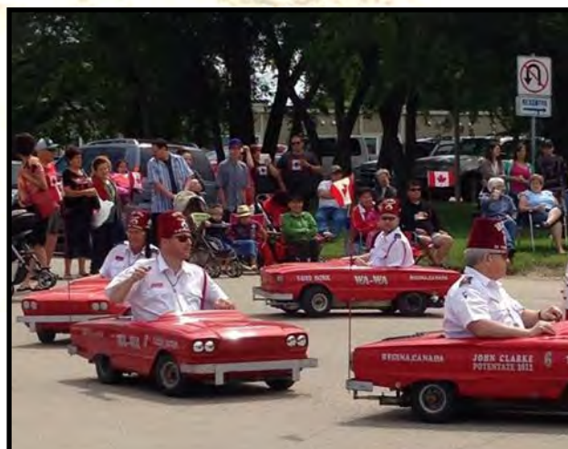
Fort Qu'appelle Parade