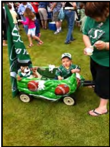
Kiddies Day parade entrant

This is one of the best parades that Swift Current participates in and the hospitality extended by the Medicine Hat Shrine is outstanding.