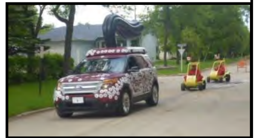
Moosomin Go Karts with the Fezmobile