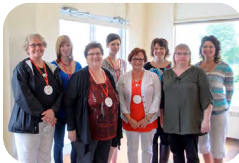
New Ladies Group Photo