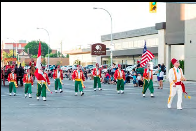
Regina Queen City Parade