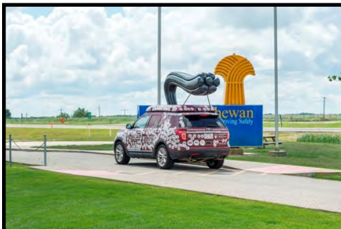
The Fezmobile entering Saskatchewan