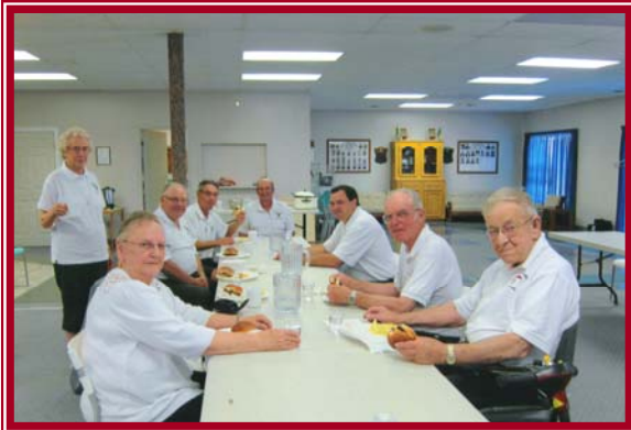
Nobles & Ladies of Goose Lake enjoying an after-parade social in Kindersley