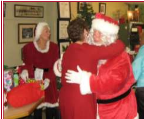
Santa receives a hug while Mrs. Claus hands out the presents