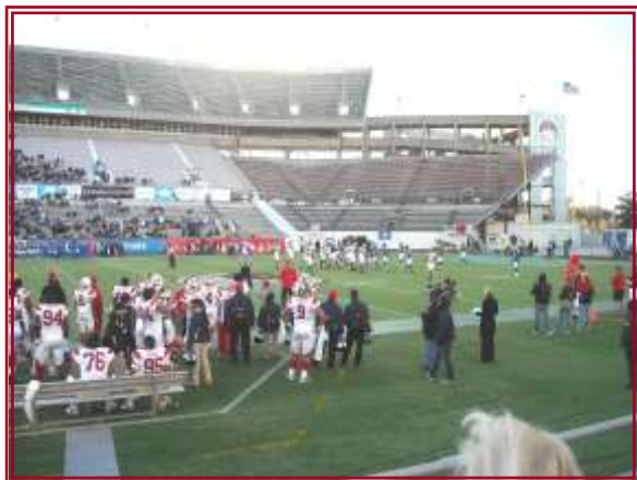
East-West Shrine Game in Orlando, FL